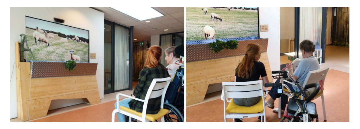
Figure 1. Design LiveNature implemented in Vitalis, including a soft-fur covered robotic sheep and an augmented reality display. The picture on the left shows an example of the interaction session with the control condition, and the picture on the right demonstrated a scenario of a participant interacting with a robotic sheep with response from the augmented reality display.

experience of typical Dutch farm scenery. The virtual content on the screen was augmented using a physical interactive interface (an old-fashioned water pump and an animal feeding trough) [29] and a physical robotic sheep, to reinforce the tactile interaction for the completeness of the multi-sensory engagement. The soft-fur covered robotic sheep is a prototype built through reprogramming a Pleo robot and is weighted similar to a real baby lamb. Since this work was undertaken in collaboration with a Dutch residential home, we addressed several aspects of the design that are familiar to a generation of elderly Dutch people to trigger reminiscence, evoke memories, and emotional responses. LiveNature combined a robotic sheep with an augmented responsive environment to: (1) provide a content-related context for improving acceptability at start of the HRI session; (2) help sustaining attention and interests during engagement by providing multiple feedback from both the robot and the screen-display; (3) create a vivid multi-sensory environment for a calm and relaxing rich interactive experience.