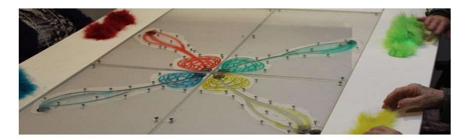
Fig. 1. The final prototype of the Dynamorph.

Adopting essential elements from the Montessori educational method such as self-exploration, task break down, rewarding system, tangible interactions [16, 18, 19], Dynamorph was designed to provide meaningful activities suited for the personal conditions of the seniors. In addition, the table was designed to fit the daily routines of the seniors, requiring only minimal involvement of nurses. Following an iterative design process, caregivers and residents with dementia were involved within the development of Dynamorph , a table with multi-layered interactive interfaces (Fig. 1).