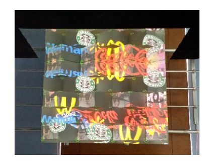
Fig. 3. Replication

Yang Sheng is an ancient Chinese Philosophy to maintain and improve one's health though daily activities. Tai Chi is one of the common meditation practices which originates in China and is still popular today, but not among the younger generation. To attract the young to this tradition, this installation uses computer vision to track the movements of the Tai Chi players and visualize their movements as well as "chi", the life energy, with a floating sphere controlled by the movements (Fig. 2).