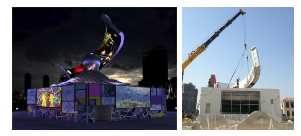
Fig. 6. Moon rising from sea

that give the impressions of a large sail, and the moon rising from the waves. Images, animations and videos can be projected onto the inner surface of sail in the evenings (Fig. 6), allowing the public to contribute their photos from social media to induce the feeling of social connectedness [8, 11, 12].