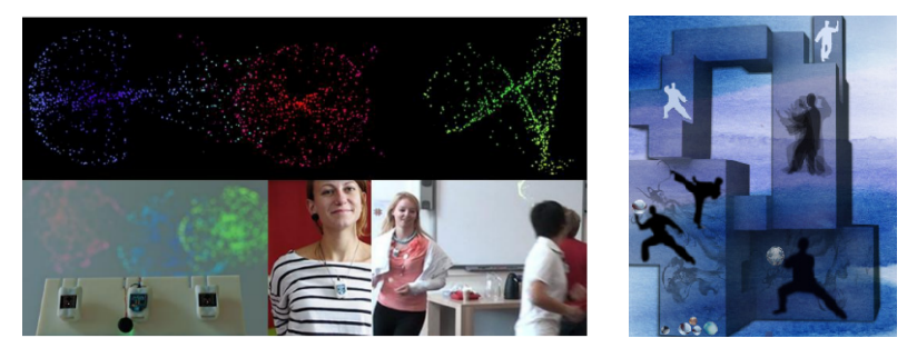
Fig. 1. Blobulous

Blobulous (Fig. 1) allows participants to interact through projected avatars, blogs of dots, which react to their movement and body signal. The participant's heart rate is mapped to the color of her avatar[8, 9]. Wireless heart rate sensors are used to capture and send heart rate data from users and a ZigBee network to handle communication between sensors and the avatars.