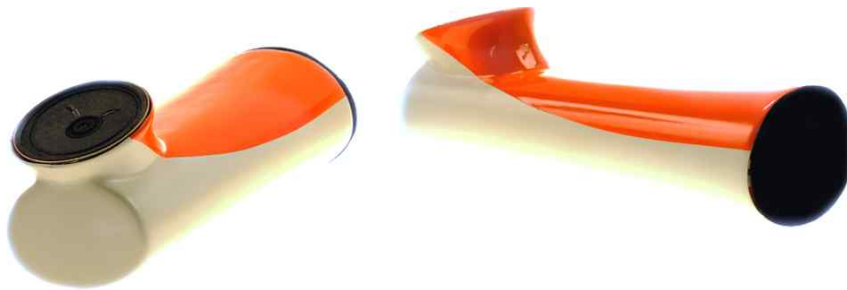
Fig. 2. Channeling device between the virtual and the physical in Augmented Home

understand possible responses. The virtual objects that can be carried using the channeling device in the prototype are the bell, the milk and the cat. When carrying a virtual object, the user would feel the channeling device to be heavier. When carrying the bell, shaking it will create a ringing sound. When carrying a cup of milk, tilting the device will spill a bit of the virtual milk. When it is tilted too far, it will spill all the virtual milk and the user would feel the device to be lighter. The user has to return to Lilly to get new milk. When the cat is picked up, a purring sound would be heard from the channeling device.