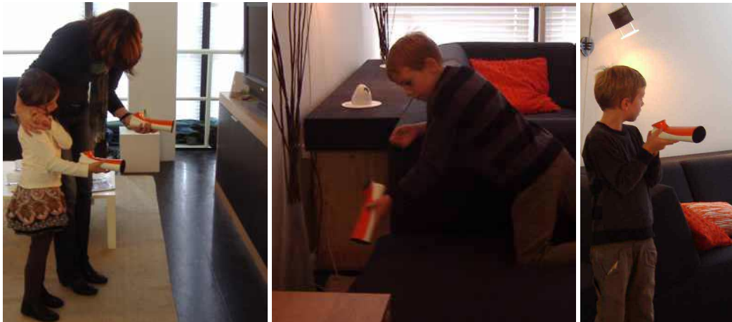
Fig. 4. User evaluation with the Augmented Home

Both the parent and child received a channeling device. A task was then introduced to them as described in previous section. Before the experiment started, the participants are given the opportunity to ask questions if there was anything not understood. They were also told that questions could be asked during the assignment if needed. The participants then performed the task (Fig. 4), after which a semi-structured interview took place with both the parent and the child together.