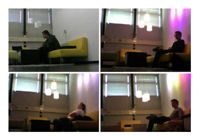
Figure 5. Screenshots of the webcam observing participants in (left-right/top-down) GC, DR, DNR, DR settings.

After the period of acclimatization the experimenter came back and checked if everything went well for the participant. The experiment followed by playing the two levels of Angry Birds game [33] on an iPad and an iPhone, and typing a sentence in a text processing app on both devices without using the backspace key. The duration of the fake experiment varied between 5 and 7 minutes.