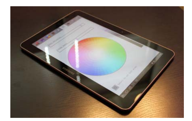
Figure 4. An Android tablet is used to control the dynamic lighting settings from outside the experiment room via a wireless network.

Figure 3. Breakout 404 - Experiment room. Picture shows the side of the waiting room with incandescent lamps and full color LED wall washers where participants were asked to wait.