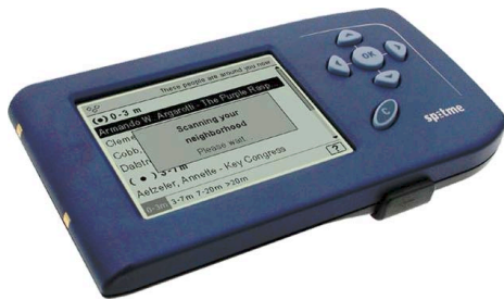
a. 2003 version used at INTERACT'03

Figure 1c shows the graphical user interfaces of some of the above functions.