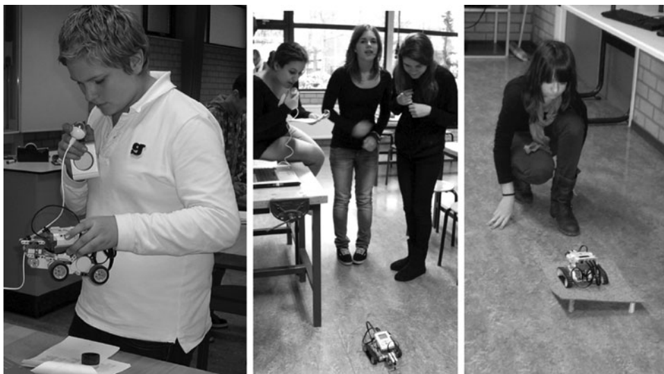
FIG. 2. Students interacting with the robots during class.