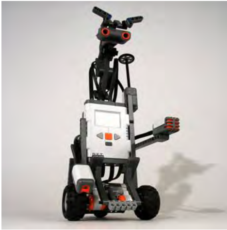
Fig. 2. Johnny Q

function that gives an estimate of the expected value Q(s,a) (the total award that may eventually be accumulated) when taking a given action “ a ” in a given state “ s ”. Through experience the machine achieves better and better estimates of the action values. The behavior of the machine is given in terms of a policy. The policy determines the probability that the machine will take a certain action in a certain state. An important dilemma in determining the policy is whether the machine should exploit its knowledge and choose the actions that lead to the biggest reward or that it should explore new actions in certain states to discover better ways to retrieve even more rewards later on.