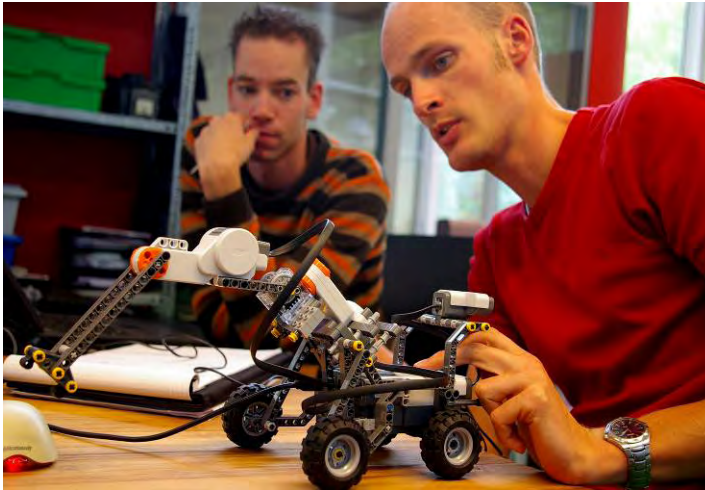
Fig. 1. The Crawler

movements, but after a few minutes it really finds a kind of rhythm allowing it to move the arm and thereby move itself efficiently forward.