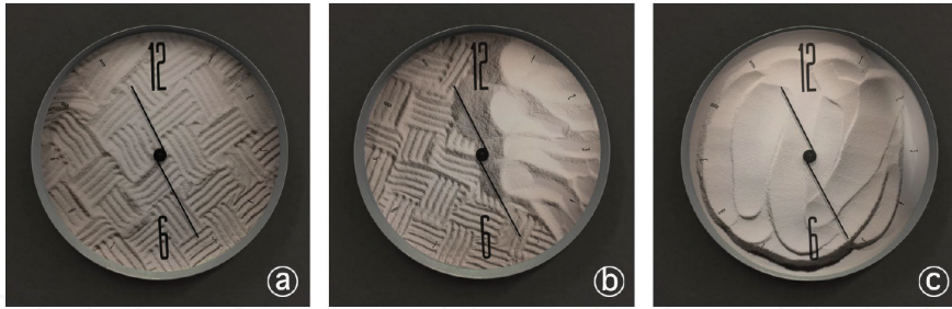
Figure 2. Static visualization. (a) Everyone in the team feels stressed. (b) Someone(s) feel stressed, someone(s) do not. (c) Everyone in the team does not feel stressed.

Static visualization ( Figure 2 ) is an ambient intervention, which is inspired by Zen garden. The sand traces changed imperceptibly slowly within a glance, so it appears to be static. When everyone in the team feels stressed ( Figure 2a ), the entire clock is covered by dense patterns, showing the even pressure of every team member. When someone(s) feels stressed, but someone(s) does not ( Figure 2b ), the sand traces appear to be bipolar: half of the clock is covered by dense traces, but half of it is not. The ratio of the two parts also displays the uneven loadings of workers. When everyone in the team does not feel stressed ( Figure 2c ), the sand traces are slowly erased, so it appears to be peaceful. With these trace patterns of the sand, the design also attempts to evoke inner peace, calmness, and tranquility of people.