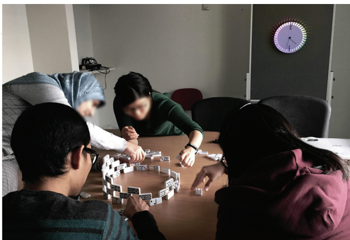
Figure 4. Experimental apparatus.

Each team was asked to finish each of the three tasks in 5 minutes. The tasks are designed in different difficulties. The first task is to collaborate with each other and make a 2D pattern that can be knocked down in one push. This refers to an easy task that associated with low-stress status. The second task is to collaborate with each other and make a 3D round tower,