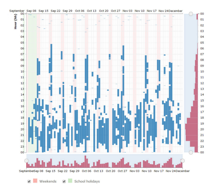
Figure 2. Visualization of TV usage during September–November 2013. The lower graph shows the total usage per day and the vertical graph shows the usage distribution per hour.

We are currently developing the tracking and activity recognition algorithms using our annotated data set. We plan to make the data available to the research community in the near future,