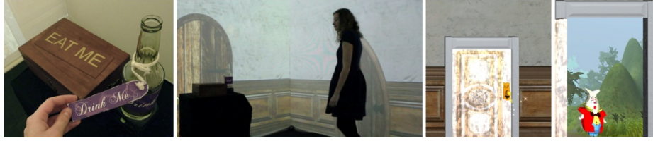
Fig. 2. The virtual room and characters. (a)The physical objects (b) User inside the CAVE (c) VR door with interactive doorknob (d) White Rabbit in the Garden