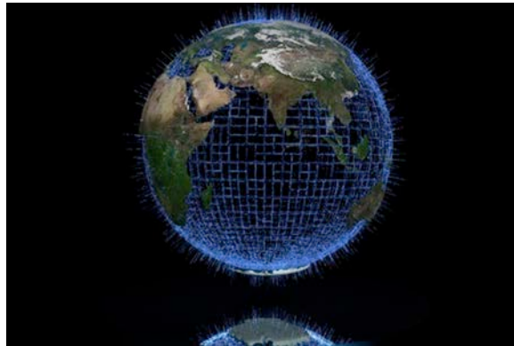
Fig. 5. A holographic project of the earth on the table

ing of the Eucharistic remnants of bread would be brought back to this table, it would focus the attention more like it was before. Burning fire (candle, oil lamp or holographic projections) will support the symbolic presence.