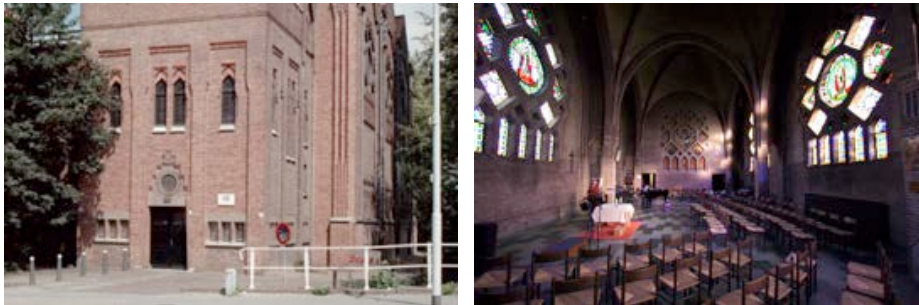
Fig. 2. The front side (left) and main hall (right) of the Eindhoven Student Chapel

(1) depending on love (e.g. happiness, bonding, friendship, caring, and lust); (2) taking power (e.g. self-confidence, maturity, autonomy, responsibility, and preservation), and (3) preparing for death (e.g. anxiety, fear, violence, destruction, and dissolution) (see for more at [4]). In this paper we introduce a more detailed version of the three universal phases, in which each phase is characterized by two to three separate symbolic stages; we call these stages ‘gateways’ to emphasize the symbolic nature of such ritualized experiences. The whole interactive experience will be build inside the Eindhoven Student Chapel (ESK [14]; see Fig. 2 left and right).