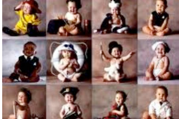
Fig. 4. A projection screen with recently newborn children from the town

There will also be offered the internet service to upload photos (or birth cards; see Fig. 4 ) of newborns from the whole environment (e.g. city of Eindhoven). This will make this stage into a spot where the whole town symbolically commemorates its origin and birth. It could unite people and in particular the citizens of Eindhoven.