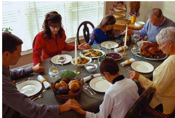
Fig. 6. A family dinner table with praying before

During the normal opening at our exhibition the space around the table will be arranged in a way that it would be natural for people to sit down to pray or to meditate. Maybe this place should rather be called a ‘house’ than a gateway. A house where the mystical movement of unification in the gift of the self, thanksgiving and transformation is at hand for everyone individually, but only when entering into and partaking in the movement of the complete community of all people. This then is every time a passing and in that sense a gateway to life out of the source that flows towards us.