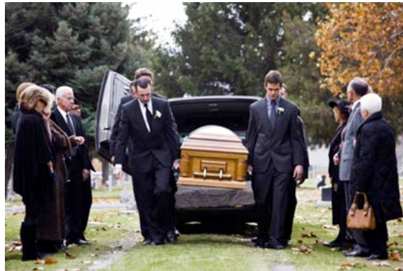
Fig. 10. A coffin as last shelter on earth to protect the dead body, carried by family and friends to its final destination

At the end of the whole experience under the closing gothic arc at the end of the main hall (see Fig. 2 ) we will finally find the last gateway. Every human being comes into the world alone, passes through the community and goes the last part of the road alone again. In all cultures there are ways of saying farewell and trying to escort man in her/his last phase as far as possible. In the Catholic tradition s/he was strengthened with forgiveness, anointment and food for the journey (i.e., viaticum; see Fig. 10 ).