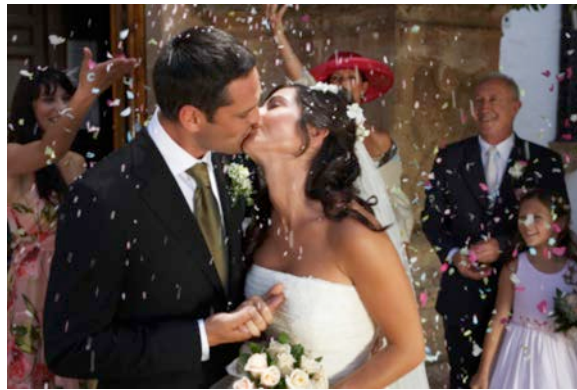
Fig. 7. Marriage as a deep symbolic unification between two partners

The symbol for this will be to the side in close proximity of the community spot (stage 3), because it is the result of it. This is about the meaning in our adult life of the concreteness of marriage, relationship, physicality and sexuality, love in hope of reciprocity; the flow that goes out and the flow that comes towards us, overwhelms us, reversal of orientation, willingness to bear the fruits of the field.