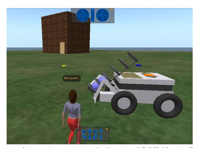
Fig. 3: A virtual agent interacting with the virtual ROILAbot in Second Life